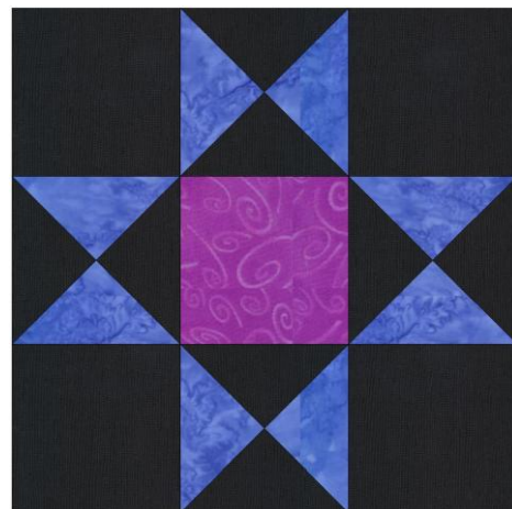
Size: 12" Finished (12-1/2" rough edges)

Don't forget to make your own block in your own colors to keep for your sampler quilt! ☺