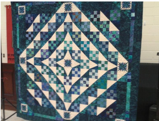
Raffle Quilt organized by Hilke several years ago for the Church that is similar to our 2016 Raffle Quilt

Hilke Hoefler is collecting "watery" blue, teal, and green batiks for the 2016 Raffle Quilt in 2-1/2 inch strips. Please bring them to the December meeting. We will be scheduling a separate sit and sew to help her make basic nine patch blocks for the quilt. Any extras will be put into a smaller charity quilt for our 2016 charity. All are invited, details to follow. Quick, easy, and everyone can have fun participating! The quilt pattern is based on the quilt shown below but with some modifications to make it unique. It will be stunning!